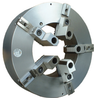
2-PIECE JAWS TYPE