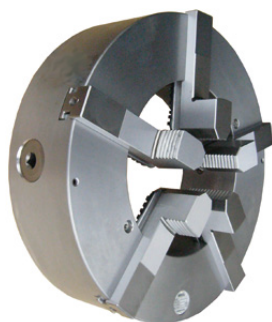
SOLID JAW TYPE

PH-1P : Solid jaw type PH-2P : 2-piece jaw type